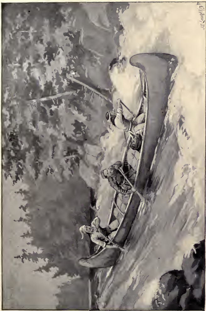
SHOOTING THE RAPIDS IN A BIRCH CANOE.